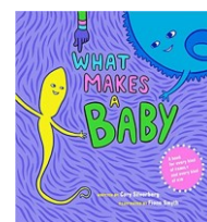
What Makes a Baby